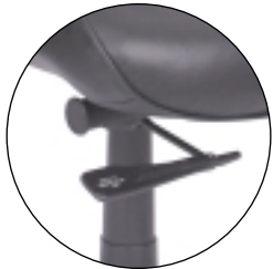
Gas lift with 3-1/2" range