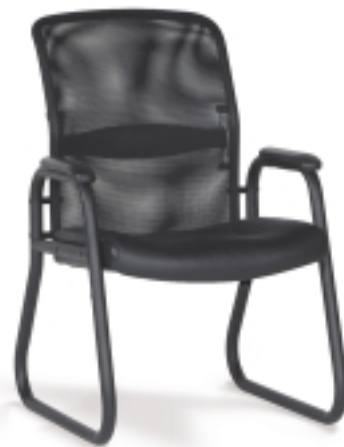
9537N Mesh Leather