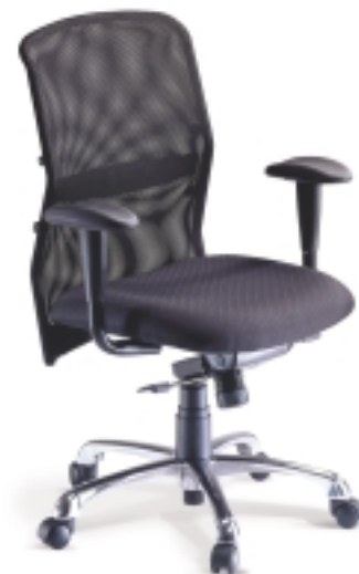
9826ZH Mesh Fabric