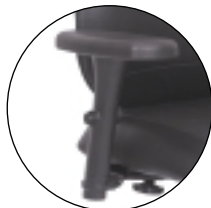
Height and width adjustable arms*