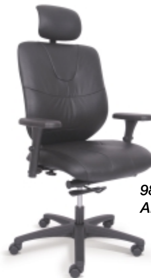
9890DM AIREASE LEATHER