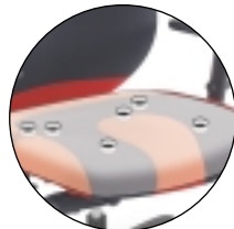
Ventilated memory foam seat