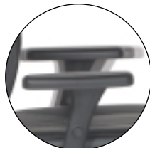
Adjustable arm pads*