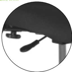
Gas lift with 10" height range