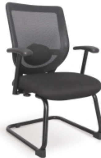
9542C Aqua II