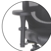
Height and width adjustable arms*