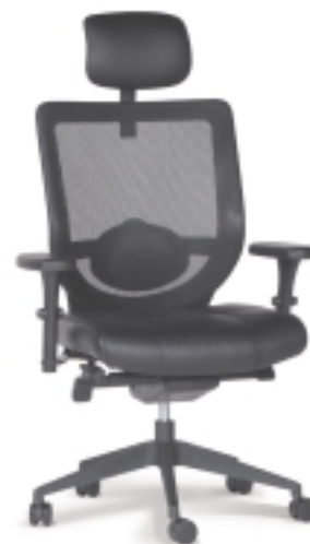
9889VM AQUA II LEATHER