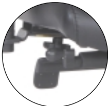
Side knob tension adjustment