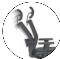
Phased two-step back release mechanism