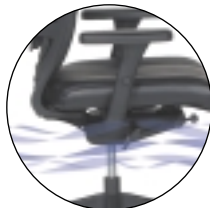
Floating synchro mechanism