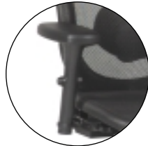
Height and width adjustable arms*