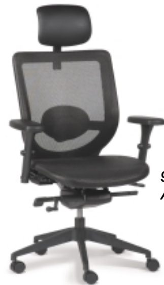
9895JM AQUA III