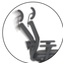
Phased two-step back release mechanism