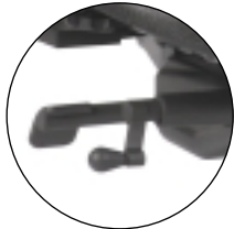
Side knob tension adjustment